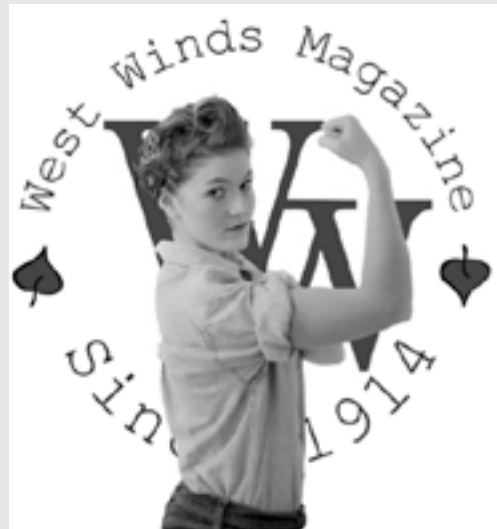
West Winds Staff